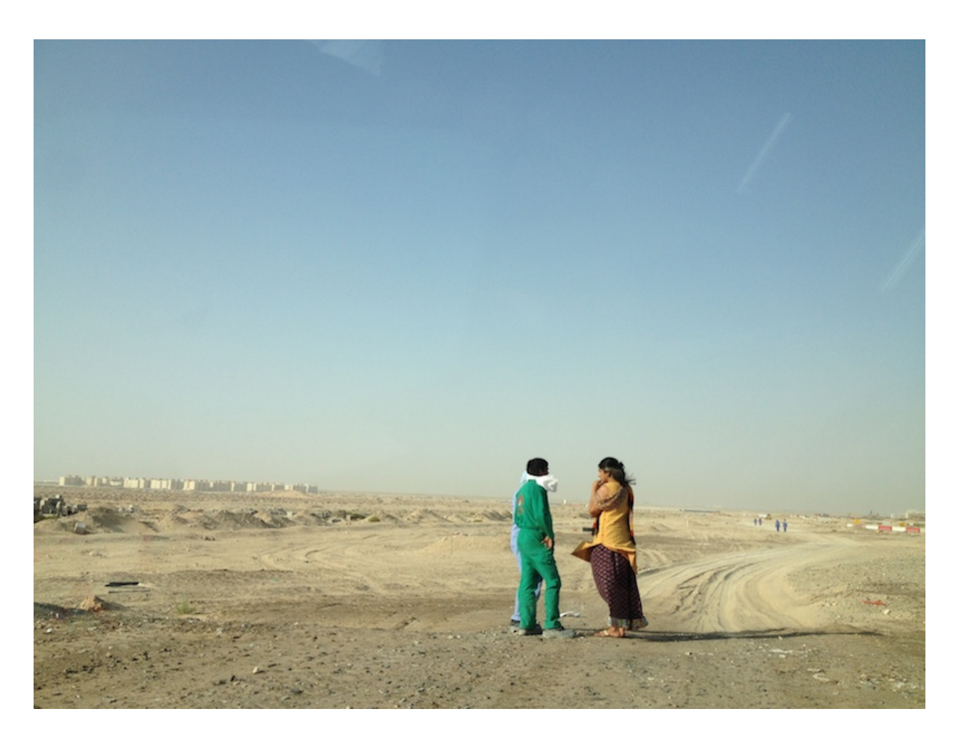
Gulf Labor member with Arabtec worker, Jebel Ali, Dubai

Omnibus reforms are needed to avoid these uneven impacts. That is why our three-point proposal to the Guggenheim combined debt relief, wage increases, and the right to independent worker representation (ideally, with workers electing their own representatives), in the understanding that these provisions are interdependent.