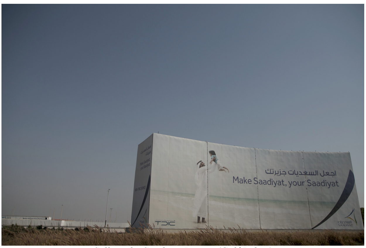
Selling the Saadiyat Dream (Gulf Labor)