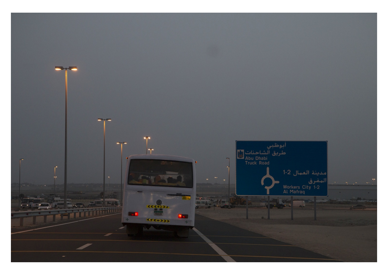
On the Road to Mafrag Workers City (Gulf Labor)

These findings added a new dimension to the observations in our first report about whether the mass labor camp, increasingly favored by the UAE authorities and their GCC counterparts, is wholly in the interests of workers. Tens of thousands of Abu Dhabi laborers live in each of the Mafraq Workers City compounds, while Qatari authorities are building seven cities to house more than a quarter-million World Cup worker. One of them, called "Labor City," will house 70,000 people in 55 buildings, and will include a mall, a jumbo mosque, and a 24,000-seat cricket stadium. The building of these vast complexes is typically promoted in a high-profile way as the government's good faith