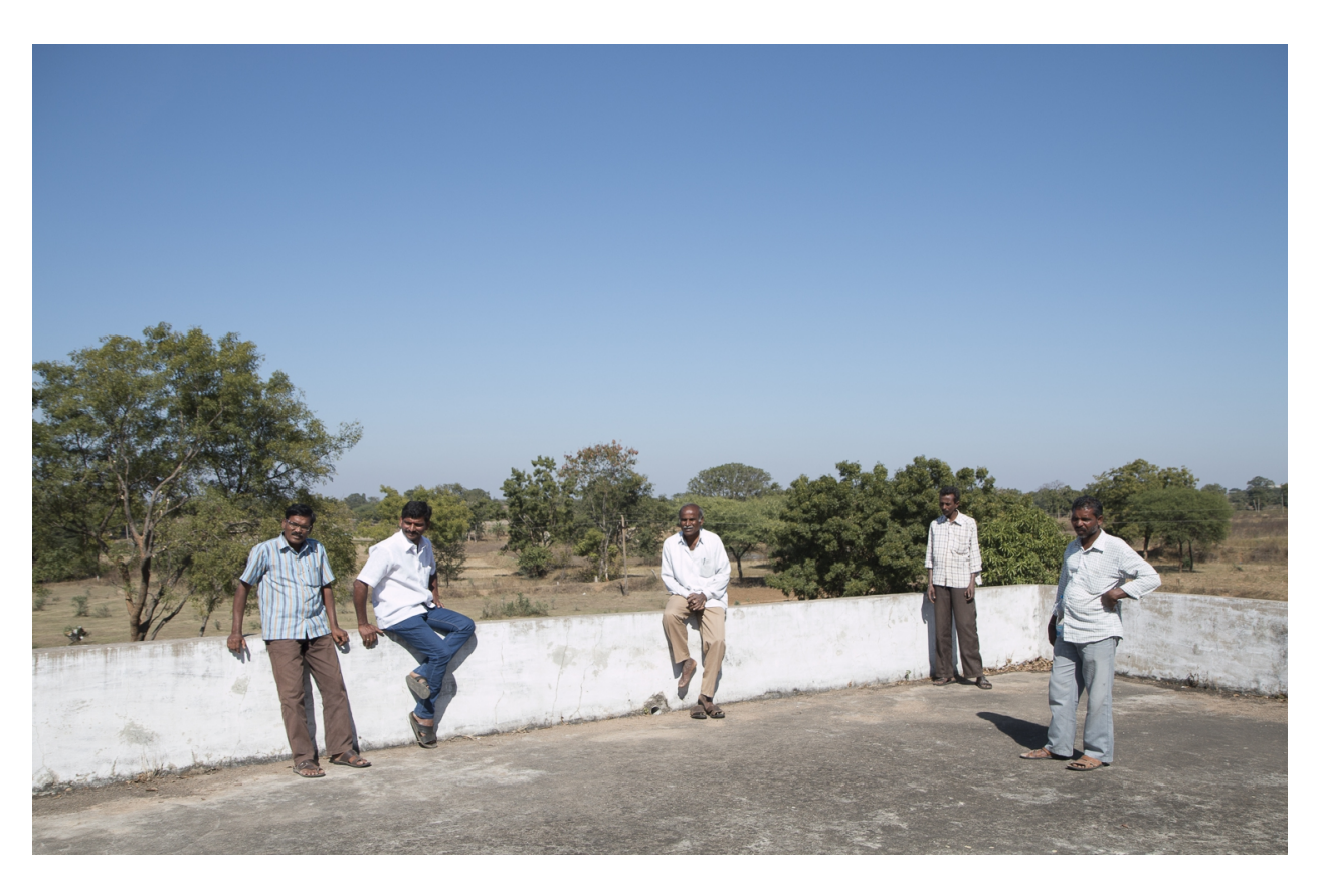
Returnee Indian migrant workers, Narsingapur, Telangana (Gulf Labor)

Most workers reported that their wages had been significantly lower than promised and that they had routinely been deceived about the terms and conditions of the employment on offer, both by recruiters and employers. They also reported a "dual contract" system whereby the contract they signed in India meant little in practice on arrival in the Gulf. Typical outcomes included sudden changes in type of work, longer hours, unpaid overtime, lengthy stints without pay, and unexpected expenses incurred from illness and work-related injuries. The emotional toll of being separated from their families for several years weighed heavily against whatever financial returns had been eked out. This was particularly the case with unskilled Dalit migrants from Telangana. As