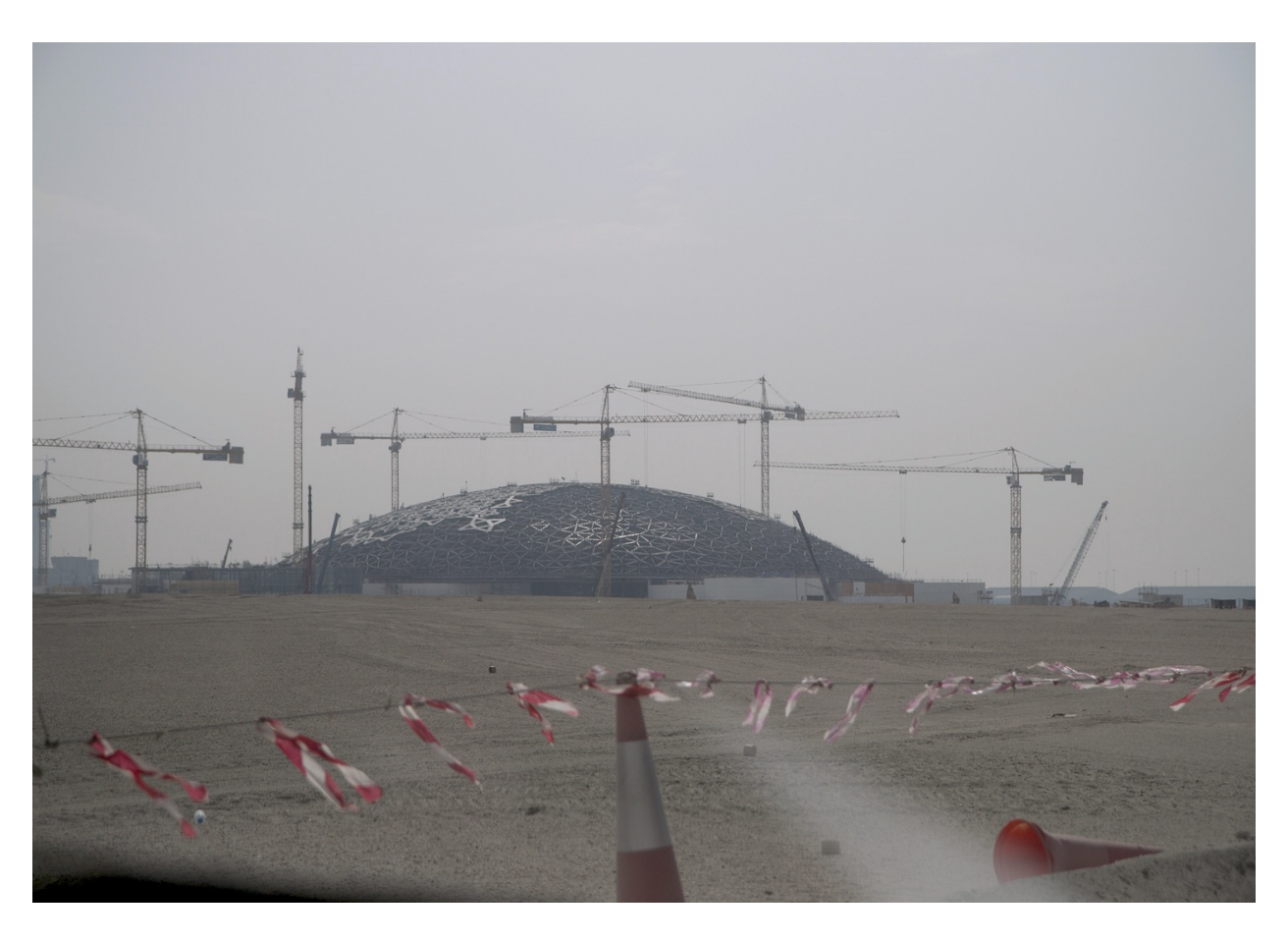
Louvre Abu Dhabi dome under construction (Gulf Labor)

In May 2015, 60 leaders from cultural institutions around the globe, including MoMA and the Tate, signed a letter protesting the entry bans on Gulf Labor members.<sup>21</sup> The letter followed several other statements from museum and artist associations: the International Committee for Museums and Collections of Modern Art (CIMAM); the Association for Modern and Contemporary Art of the Arab World, Iran, and Turkey (AMCA); L'Internationale , a European confederation of six modern and contemporary museums; six high-profile Documenta curators; and a petition signed by almost all of the participating artists in Sharjah Biennial 12. Academic organizations, including the